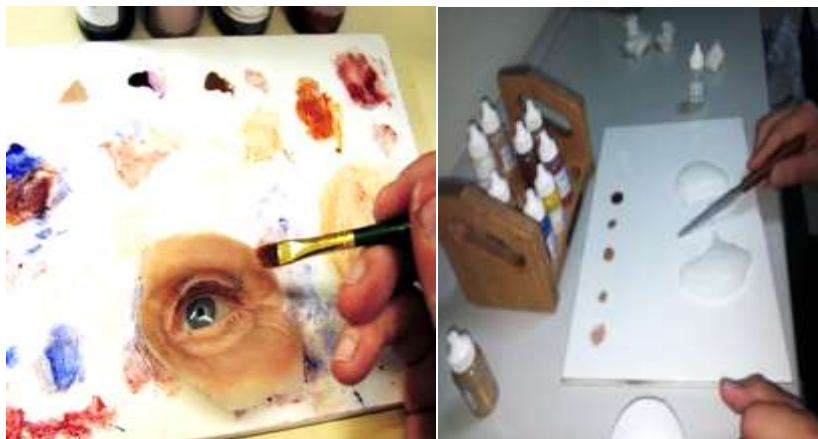
Fig. 11. Insertion of eyelashes