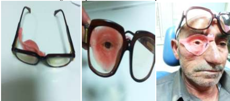
Fig. 8. Intrinsic coloration of silicone