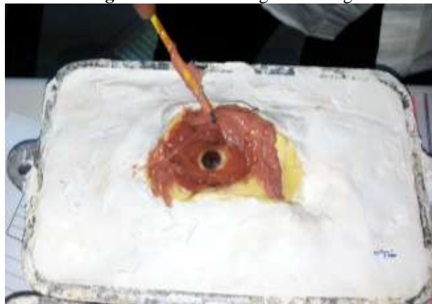
Fig. 10. Extrinsic coloration of the silicone prosthesis