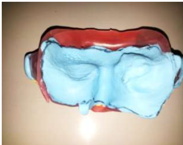
Fig. 4. Orientation marks.